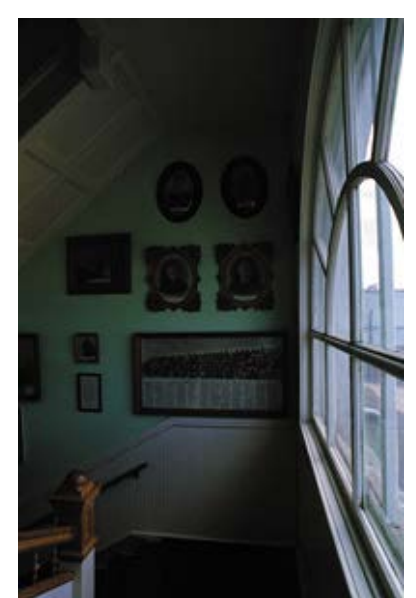
When the light level is really low, Superia 1600 really shines. Note the detail in the

The good news was that the museum's subjects were frozen in time, so movement was not an issue. The bad news was that the lighting was VERY low. How low you ask? So low that even with ISO 1600 film we had exposures of 1/30 with the aperture wide open. We set the over/under dial to -1 stop, which translated to EI 3200 and exposed a few more images. In theory, the film can handle between 1-2 stops underexposure with little quality change. The processed results will tell the tale.